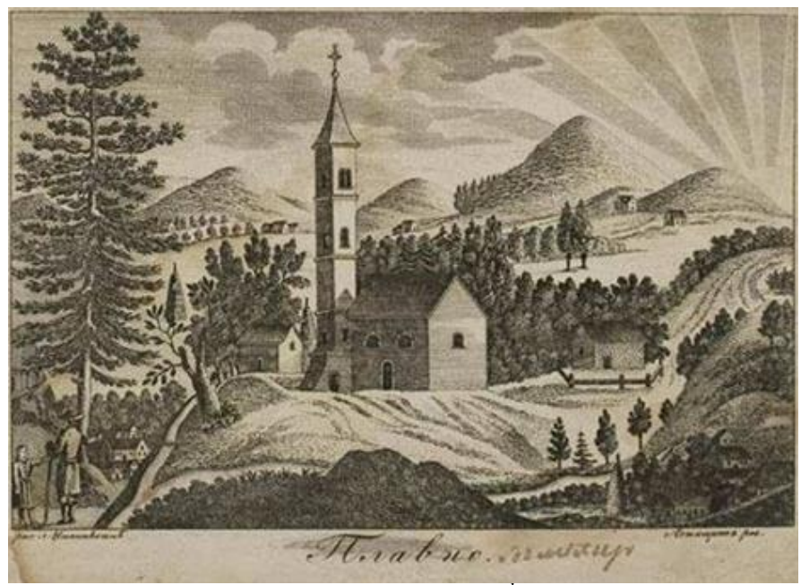
Church of St. George in Plavno, 18th century gravure

Local Homeland Society "Plavno" finished the renewal of fraternal house and, in cooperation with the Serbian Orthodox Church Diocese of Dalmatia successfully restored the roof of the church of St. George in 2013. The windows on the church were restored later, the front door was changed and the cemetery is fenced.